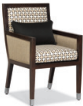
D25-52 Dining Arm Chair w23 d26.5 h35.75