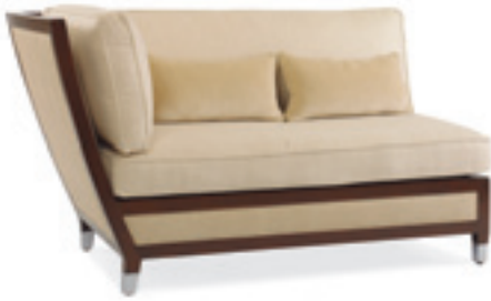
D25-41L Left Sectional Chair w60 d36.75 h34