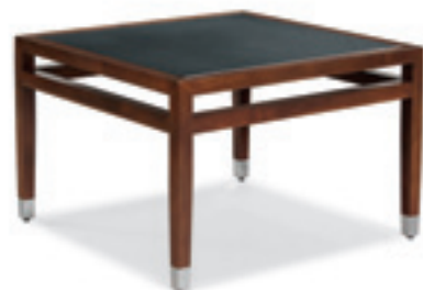
D25-84 35.75" Square "Chat" Cocktail Table w35.75 d35.75 h23