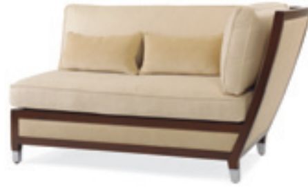
D25-41R Right Sectional Chair w60 d36.75 h34