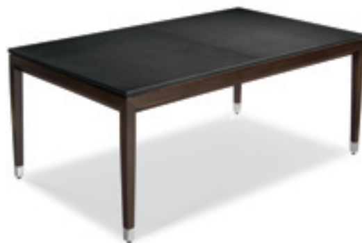
D25-92 74.75" Rectangular Dining Table w74.75 d44.5 h29.5