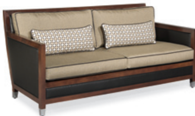
D25-42 Loveseat w76 d36 h34