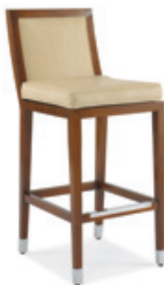
D25-57 Bar Stool w18.5 d22 h43.75