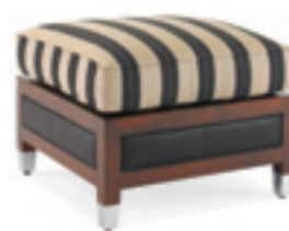
D25-31 Ottoman for Lounge Chair w24 d24 h18