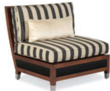
D25-11 Armless Chair w36 d36.75 h34