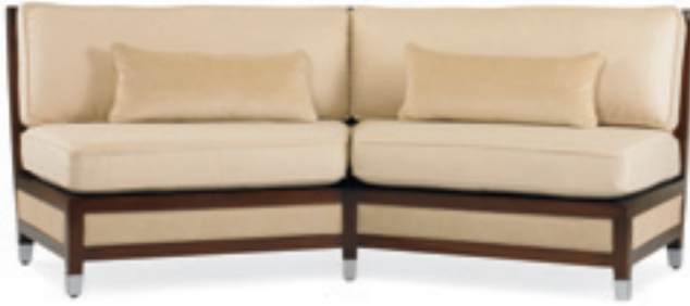
D25-40 Sectional Wedge w94.5 d52 h34