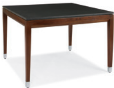
D25-91 44.5" Square Dining Table w44.5 d44.5 h29.5