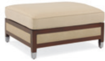
D25-32 Cocktail Ottoman w36 d36 h19