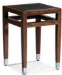
D25-82 16.25" Square Occasional Table w16.25 d16.25 h23