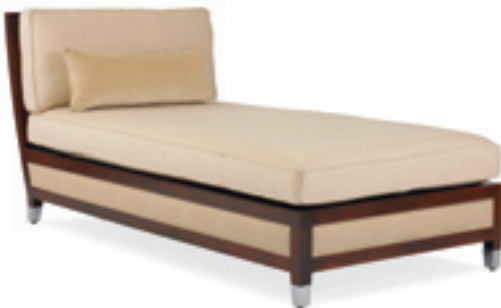
D25-71 Chaise w36 d78 h34