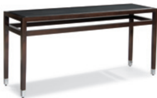
D25-87 71.75" Rectangular Console Table w71.75 d19 h31