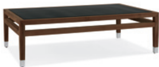
D25-85 57.75" Rectangular Cocktail Table w57.75 d35.75 h17