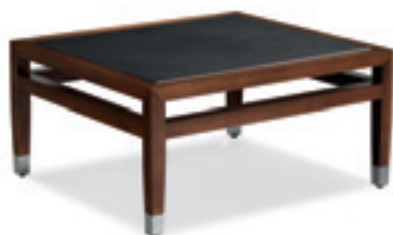
D25-83 35.75" Square Corner Table w35.75 d32 h17 Can be used with sectional pieces.