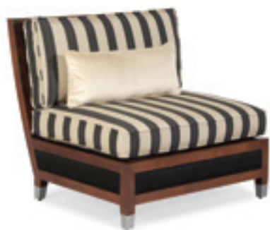
D25-11 Armless Chair w36 d36.75 h34