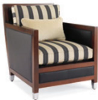
D25-12 Lounge Chair w28.5 d36.75 h34